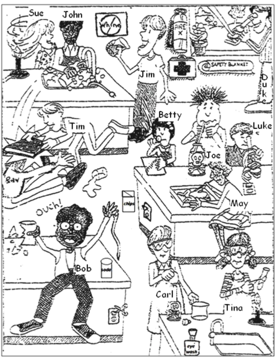
Warm-Up: SAFETY IN THE LABORATORY (page 2)

6. List 3 correct lab procedures depicted in the illustration