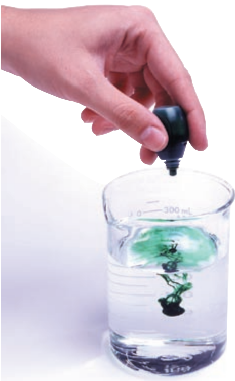
FIGURE 4.2 Diffusion results from the natural motion of particles.

In cells, diffusion plays an important role in moving substances across the membrane. Small lipids and other nonpolar molecules, such as carbon dioxide and oxygen, easily diffuse across the membrane. For example, most of your cells continually consume oxygen, which means that the oxygen concentration is almost always higher outside a cell than it is inside a cell. As a result, oxygen generally diffuses into a cell, without the cell's expending any energy.