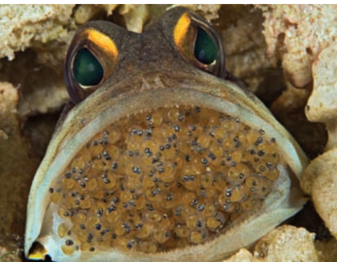
FIGURE 1.3 Reproductive strategies differ among species. The male gold-specs jawfish protects unhatched eggs by holding them in his mouth.

Need for energy All organisms need a source of energy for their life processes. Energy is the ability to cause a change or to do work. The form of energy used by all living things, from bacteria to ferrets to ferns, is chemical energy. Some organisms use chemicals from their environment to make their own source of chemical energy. Some organisms, such as plants, algae, and some bacteria, absorb energy from sunlight and store some of it in chemicals that can be used later as a source of energy. Animals get their source of energy by eating other organisms. In all organisms, energy is important for metabolism , or all of the chemical processes that build up or break down materials.