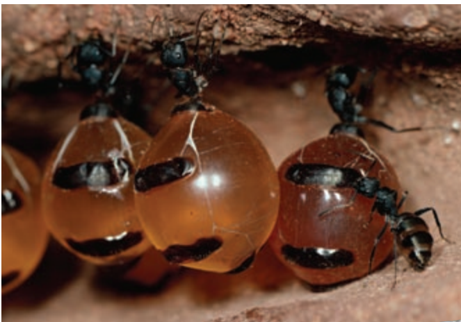
FIGURE 1.1 Honeypot ants live in deserts where food and water are scarce. Some of the ants in the colony act as storage tanks for other ants in the colony.

can store so much food for other ants that it swells to the size of a grape.